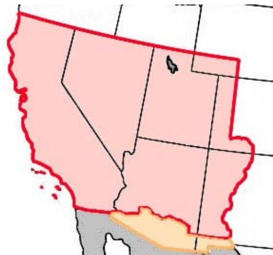
Lands ceded to the U.S. in the wake of the Mexican-American War (outlined in red) and the Gadsden Purchase (tan)

The defeat of Mexico in the Mexican War in the land that had been known as New Spain until 1821 eventually resulted in and allowed the formation of the U.S. states of California, Nevada, Utah, Arizona, Colorado, and New Mexico . It is for the reason that the state of New Mexico – through (a) its name (as an extension of the name and meaning of New Spain) and (b) its history – represents the completion of prophecy of Daniel 7:8, sending the United States toward its fulfillment of prophecy of Daniel 8:9, that the Lord chose the state of New Mexico to be a focal point of prophecy surrounding Daniel 8:9, thus further linking Daniel 7:8 with Daniel 8:9. This paragraph and this Unsealing are establishing why the history of the state of New Mexico is linked with the key events in U.S. history that fulfill Daniel 8:9. Exactly how the history of the state of New Mexico is linked with the key events