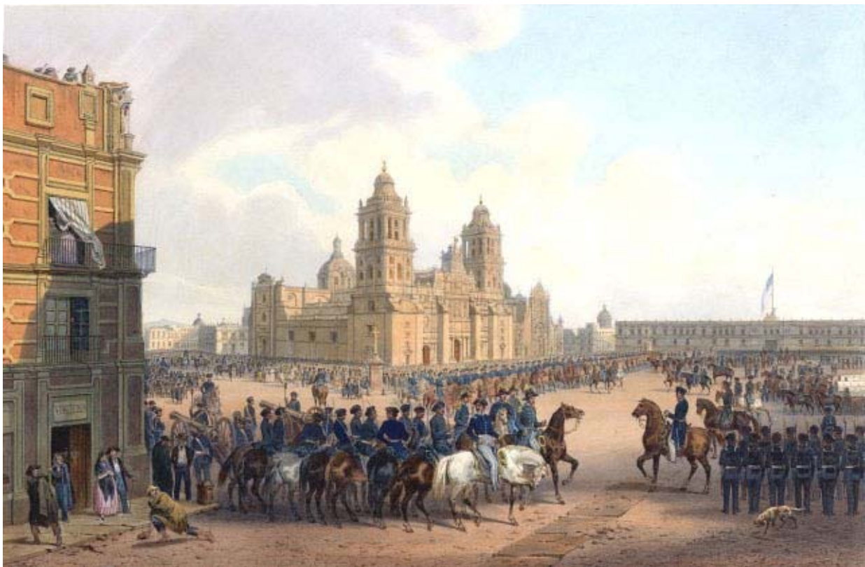
The fall of Mexico City during the Mexican-American War

Daniel 7:8 (KJV) I considered the [ten] horns, and behold, there came up among them another LITTLE HORN [a Fifth Beast, the United States of America], before whom there were THREE OF THE FIRST HORNS [England, France, and Spain, uprooted by Mexico in 1821, which was then uprooted by the United States in the 1846-1848 Mexican War] plucked up by the roots: and, behold, in this horn were eyes like the eyes of man, and A MOUTH SPEAKING GREAT THINGS [referring to (i) the Declaration of Independence and its meaning and doctrines, first read publicly by a mouth (Col. John Nixon) on 7/8, in fulfillment of Daniel 7:8, and (ii) Gutzon Borglum expressing the purpose of Mount Rushmore and in doing so using the words “the great things we accomplished as a Nation”].