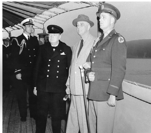
Churchill and Roosevelt aboard the USS Augusta at the August 9-12, 1941, Atlantic Conference, which resulted in the August 14, 1941, Atlantic Charter

Key Understanding: The Four Freedoms and the Atlantic Charter . The January 6, 1941, Four Freedoms were purposely and substantially incorporated into the August 14, 1941, Atlantic Charter .