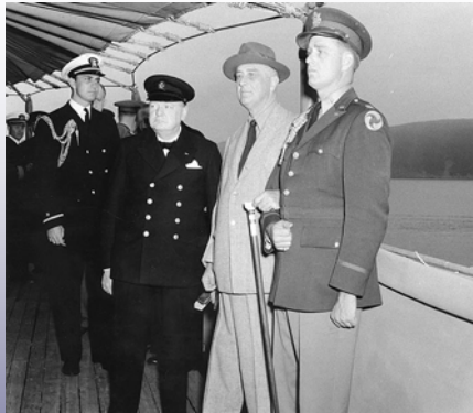
The Atlantic, August 9-14, 1941