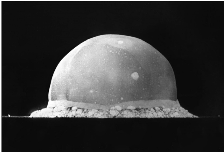
The Trinity explosion, .016 seconds after detonation. The fireball is about 200 meters (600 feet) wide.

12 And an host was given him against the daily sacrifice by reason of transgression, and it cast down the truth to the ground; and it practised, and prospered.