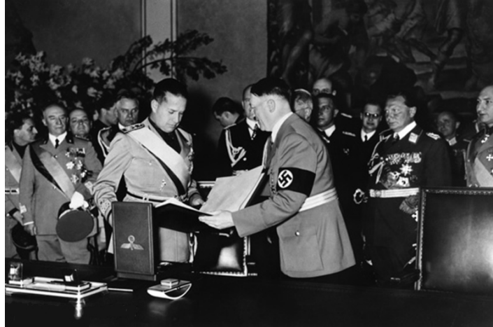
The Pact of Steel: Signing of the German-Italian Military Alliance in the New Reich Chancellery (May 22, 1939)

Article III of the Pact of Steel stated: “If one of the high contracting parties should become involved in warlike complications with another power, the other high contracting party would immediately come to its assistance with all its military forces.”