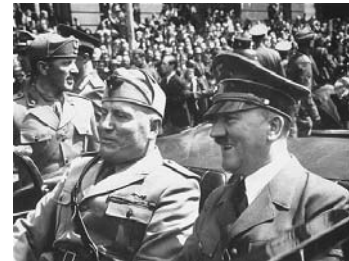
Mussolini and Hitler

Daniel 2:42 (KJV) And as the TOES OF THE FEET were part of IRON [Eisenhower, the Man of Iron, representing the western Allies of America-Britain-France, and Stalin, the Man of Steel, representing the Soviet Union], and part of CLAY [Hitler’s Germany, playing the role of Clay, yet is of the Pact of Steel], so THE KINGDOM SHALL BE PARTLY STRONG [Eisenhower’s Chief of Intelligence Kenneth Strong, representing America-Britain-France at Germany’s Surrender at 2:41 a.m., May 7, 1945], and PARTLY BROKEN [Hitler’s Germany at 2:41 a.m., May 7, 1945, playing the role of Clay, yet is of the Pact of Steel].