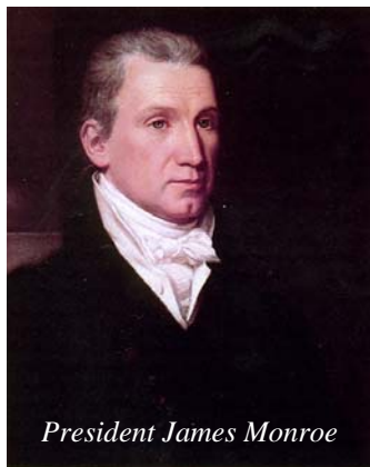
President James Monroe

The Monroe Doctrine. The Monroe Doctrine was set forth by President James Monroe in a message he delivered to the Congress of the United States on December 2, 1823. It warned European powers against interfering in the affairs of countries in the Western Hemisphere, and specifically warned them not to involve themselves with the peoples of the Western Hemisphere “for the purpose of oppressing them, or controlling in any other manner their destiny.” The Monroe Doctrine also said that the American continents were “henceforth not to be considered as subjects for future colonization by any European powers.”