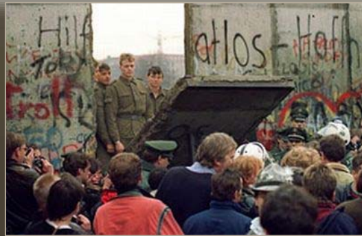
West Berliners watch on November 11, 1989, as East German border guards demolish a section of the original wall