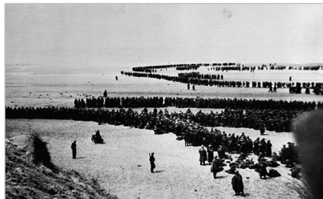
Known as the Miracle of Dunkirk, the nine days of Dunkirk stopped what was already a disastrous campaign from becoming a tragedy of epic proportions. Above right is a picture of British troops awaiting evacuation off of Dunkirk’s beaches.

Toward Dunkirk in World War II. Two events occurred on May 10, 1940. On that date, Winston Churchill became the Prime Minister of Great Britain. Also on that date, Adolf Hitler began his invasion of Western Europe. Tens of thousands of British and French soldiers who had rushed to help Belgium became surrounded and trapped by the Germans on the beaches at Dunkirk, France.