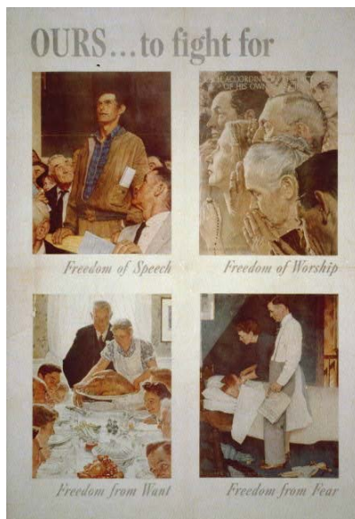
A poster (left) depicting the “Four Freedoms,” one of which is “Freedom of Worship” (right), from President Roosevelt’s famous speech of January 6, 1941

Key Understanding: The subtle deception of “religious freedom.” One of the most subtle deceptions in the battle between the Cross of Jesus Christ and the Rights of Man is that of “religious freedom.” The very words “religious freedom” should not be confused with the true spiritual freedom of the cross of Jesus Christ.