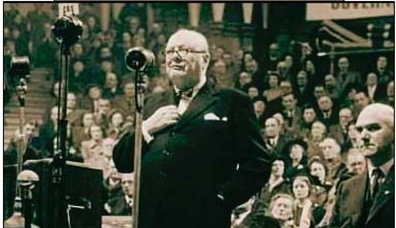
May 13, 1940, in the House of Commons