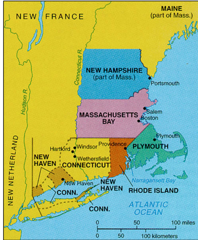
New England colonies, 1650

Key Understanding: Increase Mather's new charter for the Massachusetts Bay Colony reflected the transition from Puritan Theocracy to American Democracy. This event represented the great transition of America from Puritan theocracy to American democracy. The Puritans, of course, had always been in general opposition to the idea of governments of democracy because the rule of a government would expand beyond those in the church to all free men.