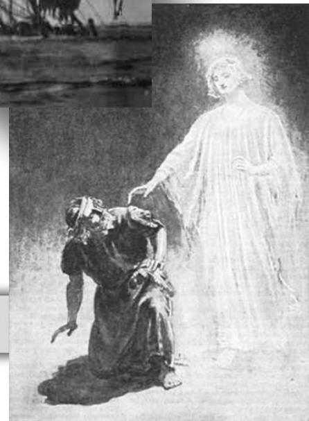
(upper right) Drawing of the Angel Gabriel off Pemaquid Point, Maine. (directly right) The angel Gabriel and Daniel.

Key Understanding: August 15, 1635, and Daniel 8:15. The destruction of the Angel Gabriel in the Great Colonial Hurricane of August 15 (8/15), 1635, was ordained to correlate with the angel Gabriel in Daniel 8:15-16, confirming the event’s part in the fulfillment of Daniel 8.