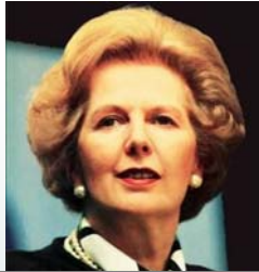
‘Thatcher-Churchillian’ Great Colonial Hurricane of 1635

Key Understanding #2: In fact, the entire episode at Aspen, Colorado, on August 2, 1990, of Thatcher urging Bush to be Churchillian was for the prophetic purpose of further linking the ‘Thatcher’ Great Colonial Hurricane of August 15, 1635, with the ‘Thatcher’ Great New England Hurricane of September 21, 1938.