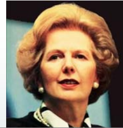
‘Thatcher-Churchillian’ Great New England Hurricane of 1938