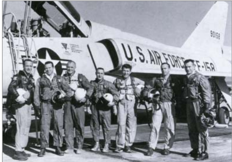
In 1962 astronauts (left to right) Lt. Cdr. M. Scott Carpenter, U.S. Navy; Maj. L. Gordon Cooper, U.S. Air Force; Lt. Col. John H. Glenn, Jr., U.S. Marine Corps; Maj. Virgil I. Grissom, U.S. Air Force; Cdr. Walter M. Schirra, Jr., U.S. Navy; Cdr. Alan B. Shepard, Jr., U.S. Navy; and Maj. Donald (Deke) K. Slayton, U.S. Air Force, received the award for pioneering human spaceflight in the United States.

Key Understanding (which is the same as is in the previous Unsealing): Alan Shepard and the Mercury Seven in history and prophecy. The reason why Alan Shepard was the first American to be launched into space, and the reason why the Mercury Seven were the first group of American astronauts to challenge the Soviet Union in the space race, is because the Lord ordained the United States – in the counterfeit fulfillment of Micah 5:5 – to play the role of the “seven shepherds” against its “Assyrian” adversary in the Cold War, the Soviet Union. Or simply, America’s famous first group of astronauts numbered seven in the counterfeit fulfillment of the seven shepherds of Micah 5:5.