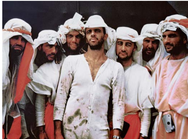
The seven original Mercury astronauts participate in U.S. Air Force survival school at Stead Air Force Base in Nevada. Pictured from left to right are L. Gordon Cooper, Jr., M. Scott Carpenter, John H. Glenn, Jr., Alan Shepard, Virgil I. Grissom, Walter M. Schirra, Jr., and Donald K. Slayton. Portions of their clothing have been fashioned from parachute material, and all have grown beards from their time in the wilderness. The purpose of this training was to prepare astronauts in the event of an emergency or faulty landing in a remote area.

“Survival training in the wild,” as NASA called it, was an important part of the training. Men preparing for flight at eighteen thousand miles an hour more than a hundred miles above the earth were “dumped” in deserts, atop rugged mountains, in Panamanian jungles and other remote sites, and left to fend for themselves. NASA generously equipped each man with a small portion of water, his survival gear, and his wits. A sense of humor and a strong stomach willing to accept lizards, snakes, insects, and whatever else could be gleaned from the inhospitable surroundings were also essential.