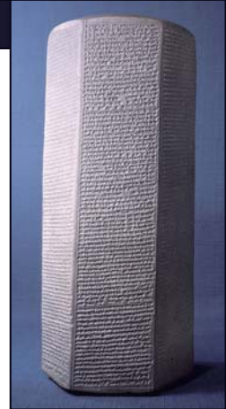
The Sennacherib prism

Here is #1887–Doc 1 , a brief explanation of the Sennacherib prism now in Chicago, Illinois, and its relationship to the biblical account of Sennacherib’s siege of Jerusalem.