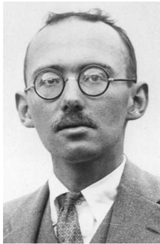
Stephen Vincent Benet

Western Star. When Stephen Vincent Benet died at the age of 44 on March 13, 1943, the very date of the edition of the Saturday Evening Post that