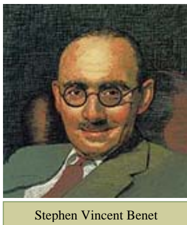
Stephen Vincent Benet

Key Understanding #2 (of Unsealing #1688): The Western Star from Bethlehem. Furthermore, the Lord ordained Stephen Vincent Benet to be born (July 22, 1898) in Bethlehem , Pennsylvania, to reveal his role as a ‘spirit of Antichrist’ child of the Western Star in contrast to the Bethlehem birth of the true Christ child, Jesus Christ – with its attachment to the Star in the East .