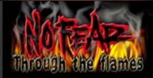
The Jewish Holocaust