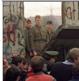
West Berliners watch on November 11, 1989, as East German border guards demolish a section of the original wall