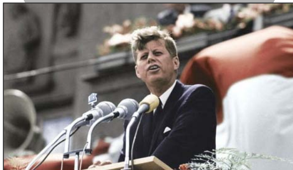
President John F. Kennedy delivers his famous “I am a Berliner” (“ich bin ein Berliner”) speech in front of the city hall in West Berlin, June 26, 1963