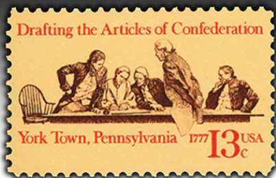
James Lovell signed the Articles of Confederation. The bicentennial of the Articles of Confederation was commemorated on this U.S. postage stamp in 1977.

There are two famous men named James Lovell in American history. The first James Lovell was a Founding Father of the United States of America, connected fully to the beginning of America’s history and the defeat of the “forerunner” 7 th Head Great Britain in the Revolutionary War. The second James Lovell – astronaut James Lovell – was instrumental in the Space Race defeat of the 7 th Head Red Beast Soviet Union in the Cold War.