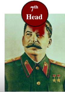
The defeat of the Soviet Union and Communism

There are two famous men named James Lovell in American history. The first James Lovell was a Founding Father of the United States of America, connected fully to the beginning of America’s history and the defeat of the “forerunner” 7 th Head Great Britain in the Revolutionary War. The second James Lovell – astronaut James Lovell – was instrumental in the Space Race defeat of the 7 th Head Red Beast Soviet Union in the Cold War.