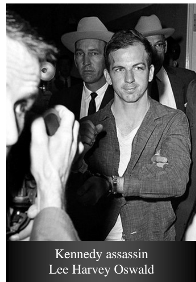
Kennedy assassin Lee Harvey Oswald

Revelation 17:10-11 (KJV) . . . and THE OTHER [the Seventh Kingdom, the USSR] IS NOT YET COME ; and when he cometh, he [the Seventh Kingdom, the USSR] must continue A SHORT SPACE . [The Space Race defined the Cold War