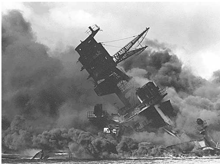
The famous picture of the USS Arizona, which burned for two days after being hit. The wreck remains at the bottom of Pearl Harbor and is a war memorial leaking a quart of oil a day.

Click here for the Original Source of #336–Doc 3