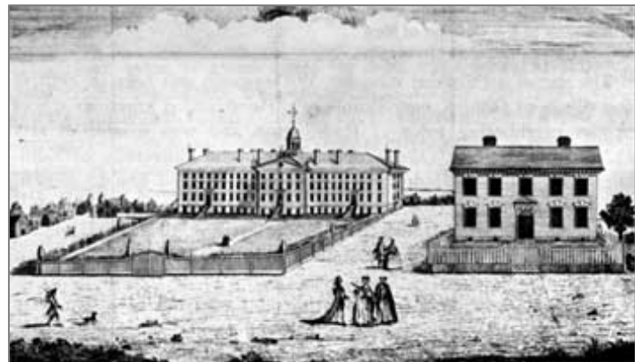
The College of New Jersey in 1764

Presbyterian ministers. It was originally founded at Elizabeth, New Jersey, in 1746 as the College of New Jersey. Its first president was Jonathan Dickinson; its second president was Aaron Burr, Sr.; its third president was Jonathan Edwards. In 1756, the college relocated to Princeton, New Jersey. Between the time of the move to Princeton in 1756 and the construction of Stanhope Hall in 1803, the college’s sole building was Nassau Hall, named for William III of