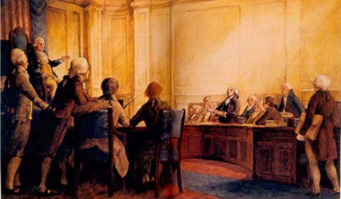
James Madison presents the Bill of Rights to the first Congress