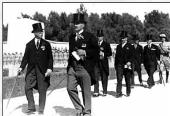
Lord Peel arrives in the British Mandate of Palestine for the Peel Commission entry

Since the Balfour Declaration of 1917 (which endorsed the idea of a Jewish state within Palestine), the British government had been struggling to reconcile the conflicting aspirations of Jews and Arabs in Palestine, which Britain administered under a League of Nations mandate. Those who still believed in the possibility of peaceful coexistence between the two groups got a grim comeuppance in July 1937 when the Peel Commission, headed by Lord Robert Peel, issued its report. Basically, the commission concluded [that] the mandate in Palestine was unworkable. There was no hope of any cooperative national entity there that included both Arabs and Jews. The impetus for the commission’s formation had been the most recent spark of Palestinian