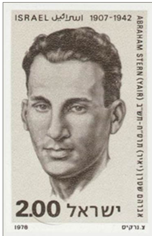
Israeli stamp commemorating Abraham Stern, issued in 1978, 30 years after the nation declared its independence

24 He will become very strong, but not by his own power. He will cause astounding devastation and will succeed in whatever he does. HE WILL DESTROY THE MIGHTY MEN AND THE HOLY PEOPLE [referencing the physical destruction of the Jews in the Nazi Holocaust, of which Kristallnacht of November 9-10-11, 1938, is often marked as a beginning].