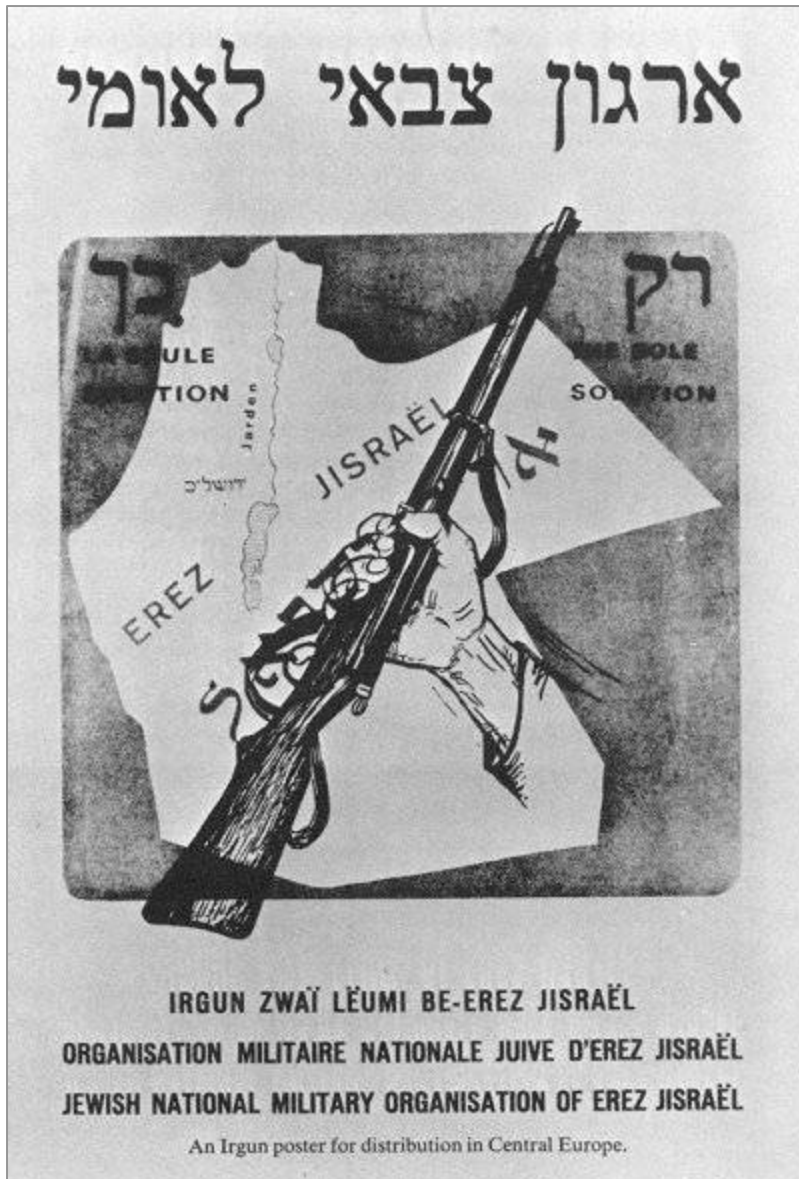
An Irgun poster for distribution in Central Europe