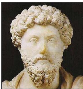
Antiochus IV Epiphanes