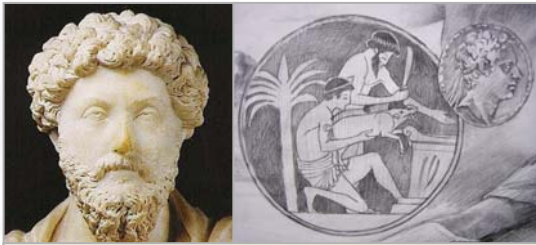
Antiochus IV Epiphanes

Key Understanding: The creations of the Jewish states after abominations. To verify that the Pu-239 August 9, 1945, Nagasaki atomic bomb is a significant part of the comprehensive fulfillment of the Matthew 24:15 Abomination of Desolation, the Lord ordained the creation of the independent Jewish state of Israel on May 14-15, 1948, to occur directly after (and partially as a result of) the Pu-239 August 9, 1945, Bohr-Farrow A-bomb Abomination of Desolation, following in the pattern of the creation of the independent Jewish state of the Hasmoneans occurring directly after and as a result of the Pig Abomination of Desolation by Antiochus IV Epiphanes.