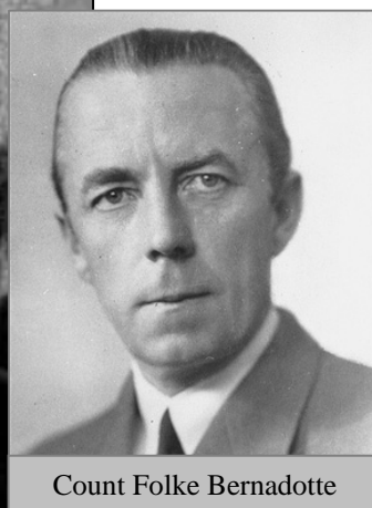
Count Folke Bernadotte

Yitzhak Shamir, one of three men who succeeded Stern at the helm of the Stern Gang (Lehi), would later become the 7 th Prime Minister of Israel. As part of Lehi’s triumvirate, he authorized the assassination of the United Nations representative in the Middle East, Count Folke Bernadotte, who was seen by Shamir and his collaborators as an anti-Zionist and “an obvious agent of the British enemy.”