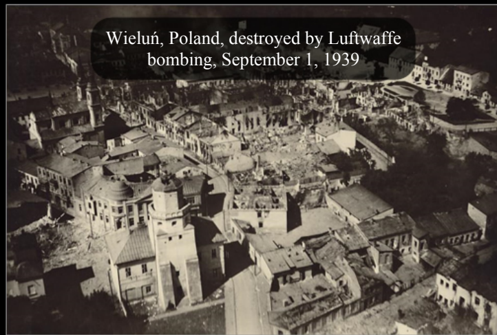
The German invasion of Poland