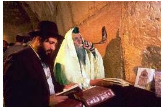
The blowing of the shofar at the wailing wall on the new moon of Tishri, in celebration of Rosh Hashanah, the Feast of Trumpets

Key Understanding: The Feast of Trumpets. The Feast of Trumpets was celebrated at the beginning of the month that became known as Tishri, the first month of the civil year. It received its name because the trumpets usually blown at the commencement of each month were on that occasion blown with unusual solemnity, for the seventh (7 th ) month was a sacred month of the religious year. The Feast of Trumpets is the progenitor of Rosh Hashanah.