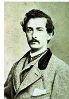
John Wilkes Booth

Key Understanding: Abraham Lincoln as a type of Moses. Obviously, Abraham Lincoln stood fully in the role as a type of Moses, delivering blacks out of Southern slavery. It is because of Abraham Lincoln’s role as a type of Moses – whose deliverance of Israel from Egypt is seen and commemorated in the Feast of Booths – that the Lord ordained the assassin of Abraham Lincoln to be a man named Booth – John Wilkes Booth. The surname Booth (A