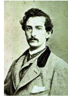
John Wilkes Booth

Key Understanding #1: Abraham Lincoln as a type of Moses. Obviously, Abraham Lincoln stood fully in the role as a type of Moses, delivering blacks out of Southern slavery. It is because of Abraham Lincoln’s role as a type of Moses – whose deliverance of Israel from Egypt is seen and commemorated in the Feast of Booths – that the Lord ordained the assassin of Abraham Lincoln to be a man named Booth – John Wilkes Booth. The surname Booth (A