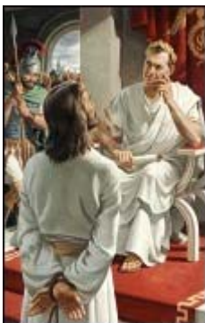
Christ standing before Pilate

Matthew 27:19-26 (KJV) When he [Pilate] was set down ON THE JUDGMENT SEAT [the judge’s seat, probably a raised stone platform in the open court of the Praetorium (Pilate’s residence in Jerusalem) representing the place of final sentence], his wife sent unto him, saying, Have thou nothing to do with that just man: for I have suffered many things this day in a dream because of him.