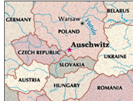
Modern day map of Europe, showing the location of Auschwitz

Here is #2080–Doc 1, a detailed map showing the main camps of the Nazi Holocaust. Read the “Overview” in the accompanying article.