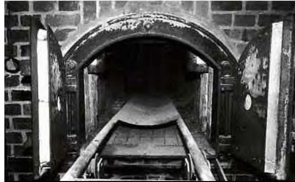
Oven that the Nazis used to cremate Jews

Key Understanding: The holocaust sacrifices in the Old Testament. Not only does the word Holocaust that refers to the mass slaughter of European Jews in World War II have its linguistic roots in the Old Testament holocaust sacrifices of animals, but the Holocaust itself has its prophetic roots in those same sacrifices. In other words, the reason behind the Lord's ordainment of the Holocaust is prophetically tied to the holocaust sacrifices of the Old Testament.