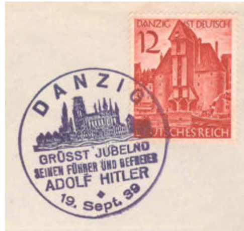
“Danzig is German”. Postage stamp issued by Nazi Germany to celebrate the annexation of Danzig by the Third Reich after the invasion of Poland.

Key Understanding #2 (which is the same as is in the two previous Unsealings): The dispute over the Polish Corridor, which included Hel Spit. The Polish Corridor refers to a corridor of land that allowed Poland to be linked to the Baltic Sea, which encompassed land that belonged to Germany in World War I, and, furthermore, which now split in two what was part of Germany during World War I. Adolf Hitler's premise for beginning World War II significantly surrounded the dispute over the city of Danzig (Gdansk, Poland today) and the Polish Corridor, which included Hel Spit. The spiritual/prophetic and even historical point is that the Lord ordained the land (the Polish Corridor) that included the Hel Spit to be directly linked to Hitler's excuse for the invasion and occupation of Poland – which led to the death of millions of Jews – for the purpose of illustrating that the Lord was not going to be mocked concerning the mocking of, spitting upon, striking of, and crucifixion of his Son, Jesus Christ.