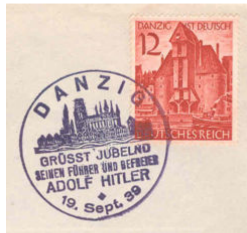
“Danzig is German”. Postage stamp issued by Nazi Germany to celebrate the annexation of Danzig by the Third Reich after the invasion of Poland.

Key Understanding #2 (which is the same as is in Unsealings #2094–#2097): The dispute over the Polish Corridor, which included Hel Spit. The Polish Corridor refers to a corridor of land that allowed Poland to be linked to the Baltic Sea, which encompassed land that belonged to Germany in World War I, and, furthermore, which now split in two what was part of Germany during World War I. Adolf Hitler’s premise for beginning World War II significantly surrounded the dispute over the city of Danzig (Gdansk, Poland today) and the Polish Corridor, which included Hel Spit. The spiritual/prophetic and even historical point is that the Lord ordained the land (the Polish Corridor) that included the Hel Spit to be directly linked to Hitler’s excuse for the invasion and occupation of Poland – which led to the death of millions of Jews – for the purpose of illustrating that the Lord was not going to be mocked concerning the mocking of, spitting upon, striking of, and crucifixion of his Son, Jesus Christ.