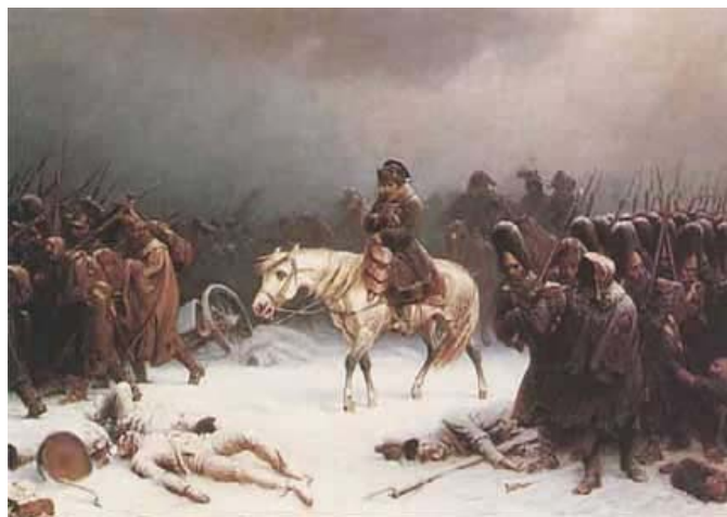
Napoleon’s retreat from Moscow by Adolph Northen in the 19 th century

Napoleon’s Grand Army, including a substantial contingent of Polish troops, set out with the intention of bringing the Russian Empire to its knees, but his military ambitions were frustrated by a combination of the Russians and an appalling winter climate; few returned from the march on Moscow. The failed campaign against Russia proved to be a major turning point in Napoleon’s fortunes.