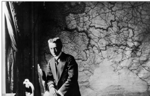
Alexander Kerensky in front of a map of the Pale of Settlement

Revelation 6:2 (KJV) And I saw, and behold A WHITE HORSE : and HE THAT SAT ON HIM [Woodrow Wilson on April 2, 1917 – and we can call his horse Man o’ War ] HAD A BOW ; and a crown was given unto him: and HE WENT FORTH CONQUERING, AND TO CONQUER.