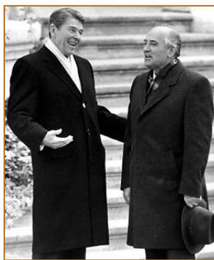
Ronald Reagan (left)

Revelation 6:5 (KJV) And when he had opened THE THIRD SEAL , I heard the third beast say, Come and see. And I beheld, and to A BLACK HORSE ; and he [Ronald Reagan, who died on June 5, 2004, symbolically dismounting for the last time the black horse, Sergeant York] that sat on him had A PAIR OF BALANCES IN HIS HAND.