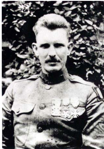
Sergeant Alvin York

Sergeant York, the man. The namesake of Ronald Reagan’s black horse, Sergeant York, was America’s greatest soldier hero of World War I, Sergeant Alvin York. On October 8, 1918, York was a member of a patrol sent to silence German machine-gun nests. In this single battle, he killed about 25 soldiers and forced a German major to order the surrender of about 130 others, completely overtaking a German-controlled hill. York received the Congressional Medal of Honor for his deed. French military leader Marshall Ferdinand Foch called it “the greatest thing accomplished by any private soldier of all the armies of Europe.” York was a corporal at