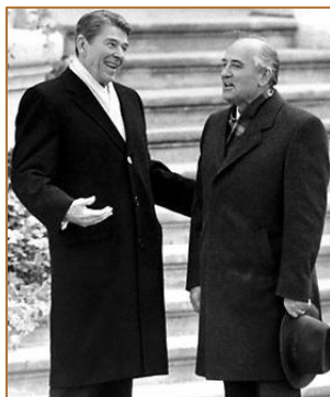
Ronald Reagan (left)

Revelation 6:5 (KJV) And when he had opened THE THIRD SEAL , I heard the third beast say, Come and see. And I beheld, and lo A BLACK HORSE : and he [Ronald Reagan, who died on June 5, 2004, symbolically dismounting for the last time the black horse, Sergeant York] that sat on him had A PAIR OF BALANCES IN HIS HAND.