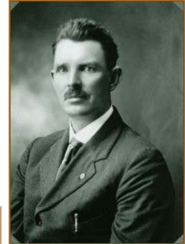
Sergeant Alvin York