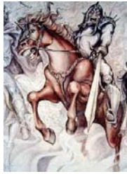
Red Horse Rider

On November 7 (October 25 on the old Russian calendar), 1917, armed workers led by the Bolsheviks took control over Petrograd. Early that evening, the Winter Palace, headquarters of the Alexander Kerensky-led democratic Provisional Government, was seized. Members of its government were arrested. Then, after a bloody struggle in Moscow on November 15, 1917, leaving over 4,000 killed, the Bolsheviks controlled the city. [One source on this is World Book Encyclopedia , Vol. 20, p. 54, © 1990, under Union of Soviet Socialist Republics.]