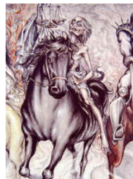
Black Horse Rider

Remember, this time period reflected the birth of the Red Beast (and Red Horse Rider) Soviet Union as well as the second ascension of the Scarlet Beast (and Black Horse Rider) America.