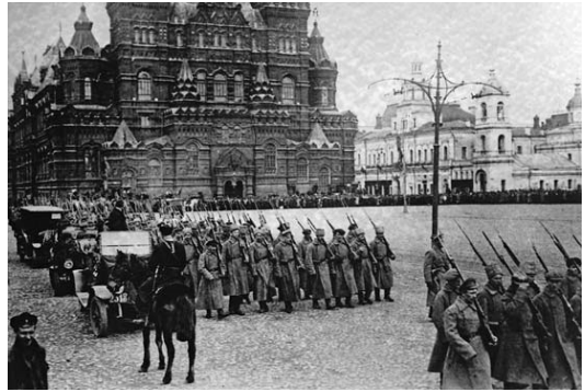
Bolshevik forces marching in Red Square, undated photo

Key Understanding: The relationship between Sergeant York and the capture of Moscow by the Reds. The rise of the Red Beast/Red Horse Rider in Moscow itself occurred on November 15, 1917, the same day that Alvin York was inducted into the U.S. Army, exactly 209 years after the November 15, 1708, birth of William Pitt. This was to show the strong and entwined prophetic relationship between the birth of the Red Beast USSR and the second ascension of the Scarlet Beast United States. Or, it can be seen that the capture by the Bolsheviks of the city of Moscow, which would become the capital city of the Soviet Union, took place on November 15, 1917, exactly 209 years after the November 15, 1708, birth of William Pitt, because America is the Scarlet Beast out of the Pit, of which the Red Beast USSR was a counterfeit.