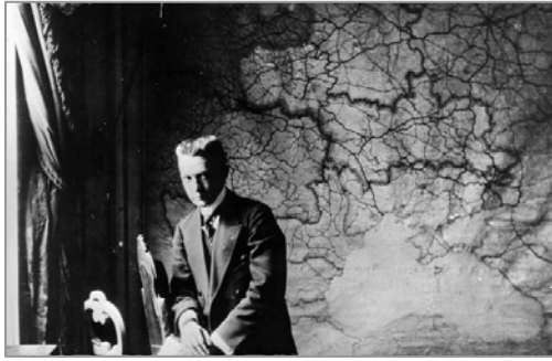
Alexander Kerensky in front of a map of the Pale of Settlement

(ii) April 2, 1917 – Alexander Kerensky’s democratic Provisional Government ended the Pale of Settlement