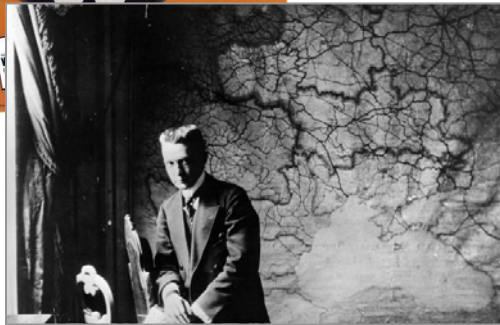
WHITE HORSE RIDER 1 st Russian Revolution of 1917

Review (from the previous two Unsealings): Democracy defeats the pale horse and its rider. The April 2, 1917, events of (a) Woodrow Wilson’s war message to enter the U.S. into World War I and (b) Kerensky’s democratic Provisional Government’s abolition of the Pale of Settlement specifically prophetically represent(ed) the defeat of the Romanov Russian Empire in its role as a preceding Pale Horse Rider persecutor of the Jews.