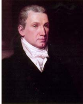
President James Monroe

The 1815 Holy Alliance and the “fourth part of the world.” The Holy Alliance also tried to interfere with Latin America, but was stopped by British disapproval and by the Monroe Doctrine of United States President James Monroe, whose interest was in protecting the independence of countries in the “fourth part of the world.”