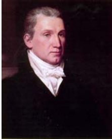
President James Monroe

Key Understanding: The fourth part(ition) of the earth and the fourth partition(s) of Poland. There is a direct historical relationship between (i) the New World being known as the “fourth part of the world” and (ii) the first fourth partition of Poland.