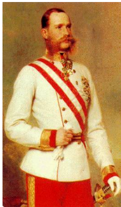
1864 portrait of Franz Joseph