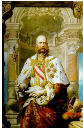
1879 portrait of Franz Joseph