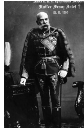
1916 picture of Franz Joseph