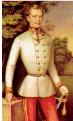
1854 portrait of Franz Joseph

Key Understanding: The 68-year rule of Austrian Emperor Franz Joseph. The Lord ordained an exact 68-year (less 11 days) reign for Franz Joseph for the purpose of confirming the Austrian Empire’s role as a Revelation 6:8 Pale Horse Rider.