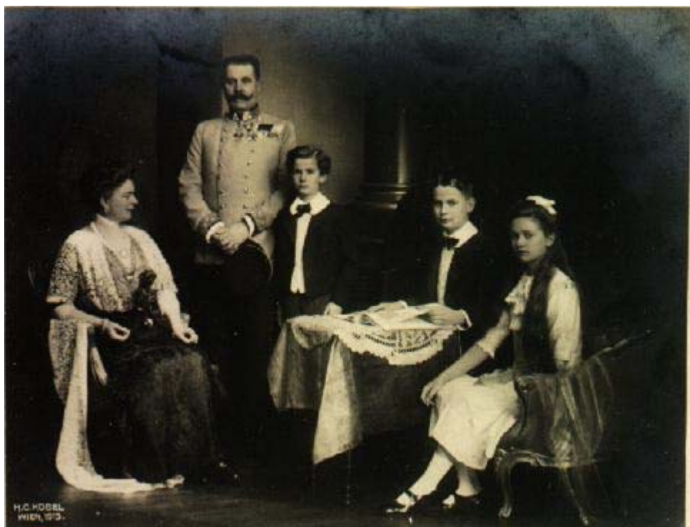
Franz Ferdinand and his family