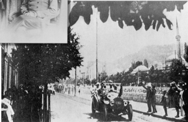
( below ) June 28, 1914: Franz Ferdinand’s and Sophie’s car a few seconds before the assassination

Revelation 6:8 (KJV) And I looked, and behold A PALE HORSE: and his name that sat on him was DEATH, AND HELL followed with him . . .