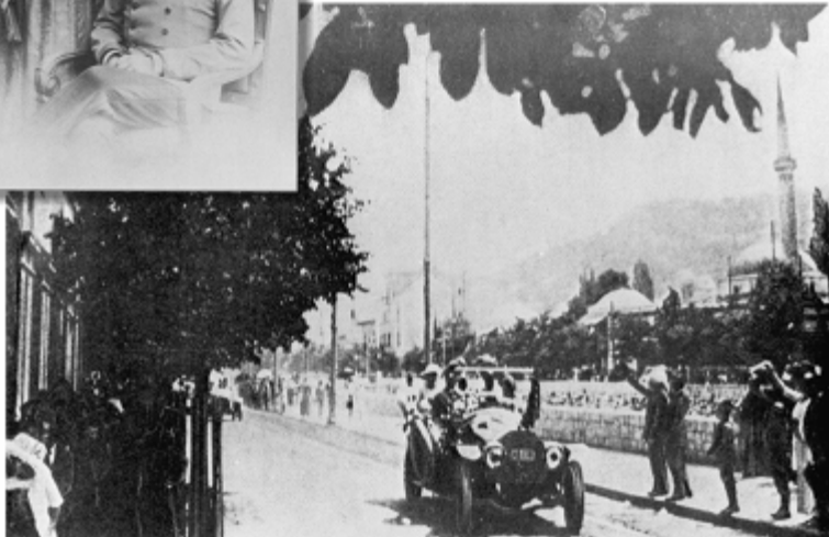
( below ) June 28, 1914: Franz Ferdinand’s and Sophie’s car a few seconds before the assassination

Revelation 6:8 (KJV) And I looked, and behold A PALE HORSE: and his name that sat on him was DEATH, AND HELL followed with him . . .